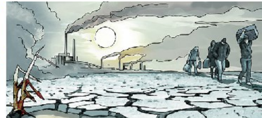
Preparing for the health effects of Climate change