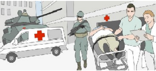
Healthcare in Armed Conflict